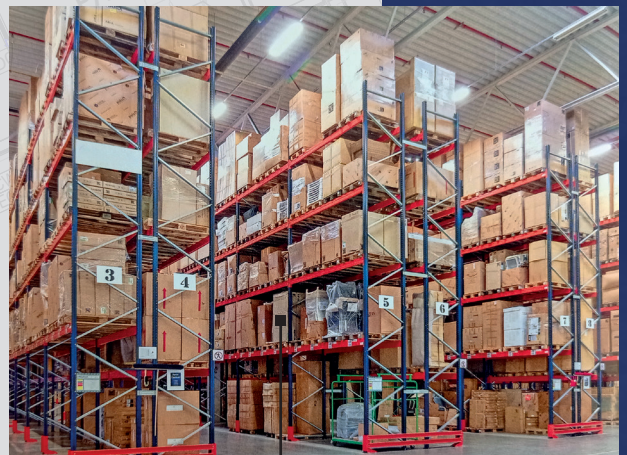
Views of proposed new office, meeting, and warehouse spaces